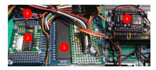
FIGURE 3. The module design of the device. (1) indicates microcontroller unit, (2) driver motor servo, (3) buzzer alarm, (4) Node MCU 8266.

The design of the module was shown in FIGURE 3 with the caption: 1. Microcontroller 2. Motor driver, 3. Buzzer/ Alarm, 4. Module WiFi Nodemcu ESP8266.