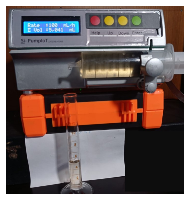
FIGURE 4. Testing the syringe pump with a measuring cup

Based on a 5 ml measuring cup target, the drug rate in the syringe pump is 100mL/h. The total volume is 5.041mL; based on Table 1 in the 5th test, the volume counter sensor reads 232 data, so the sensor accuracy is 0.0217 mL. Likewise, for the 10 ml measuring cup target, based on table 2 of the 1st test, the total volume is 10.039 mL with a sensor reading of 462, so the sensor accuracy is 0.0217 mL.