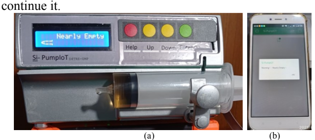
FIGURE 5. (a) Nearly empty alarms and notifications (b). Nearly empty notification sent to a smartphone.

Multidisciplinary: Rapid Review: Open Access Journal